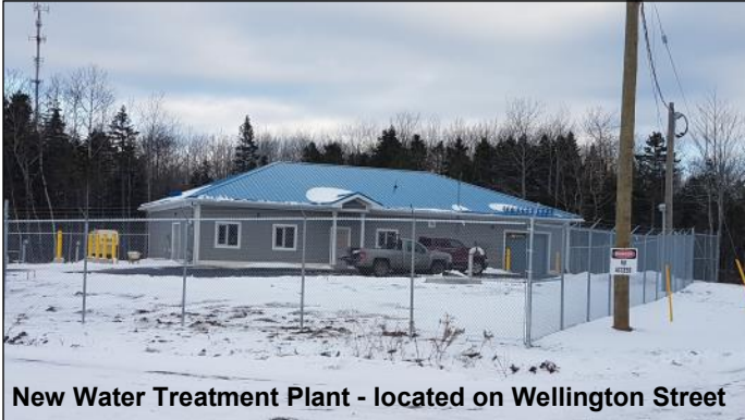
New Water Treatment Plant - located on Wellington Street